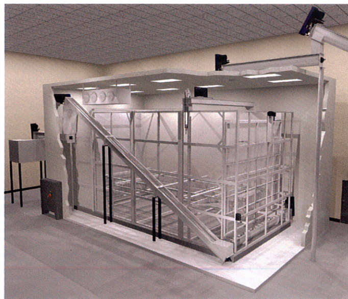
North Star insulated enclosures will fit in existing or new ice plants.